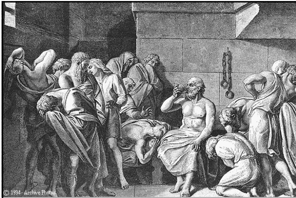
The Death of Socrates