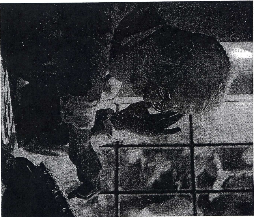
Sir Ronald A. Fisher

Honorary Research Fellow, Division of Mathematical Statistics, C.S.I.R.O., University of Adelaide; Foreign Associate, United States National Academy of Sciences, and Foreign Honorary Member, American Academy of Arts and Sciences; Foreign Member of the Swedish Royal Academy of Sciences, and the Royal Danish Academy of Sciences and Letters; Member of the Pontifical Academy; Member of the German Academy of Sciences (Leopoldina); formerly Galton Professor, University of London, and Arthur Balfour Professor of Genetics, University of Cambridge